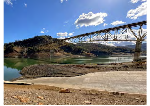
LAKE SONOMA NOVEMBER 2022