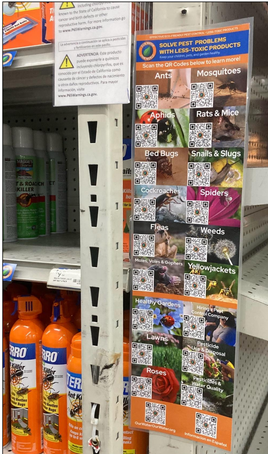
Figure A1. Trackable QR Code Poster in Store Aisle