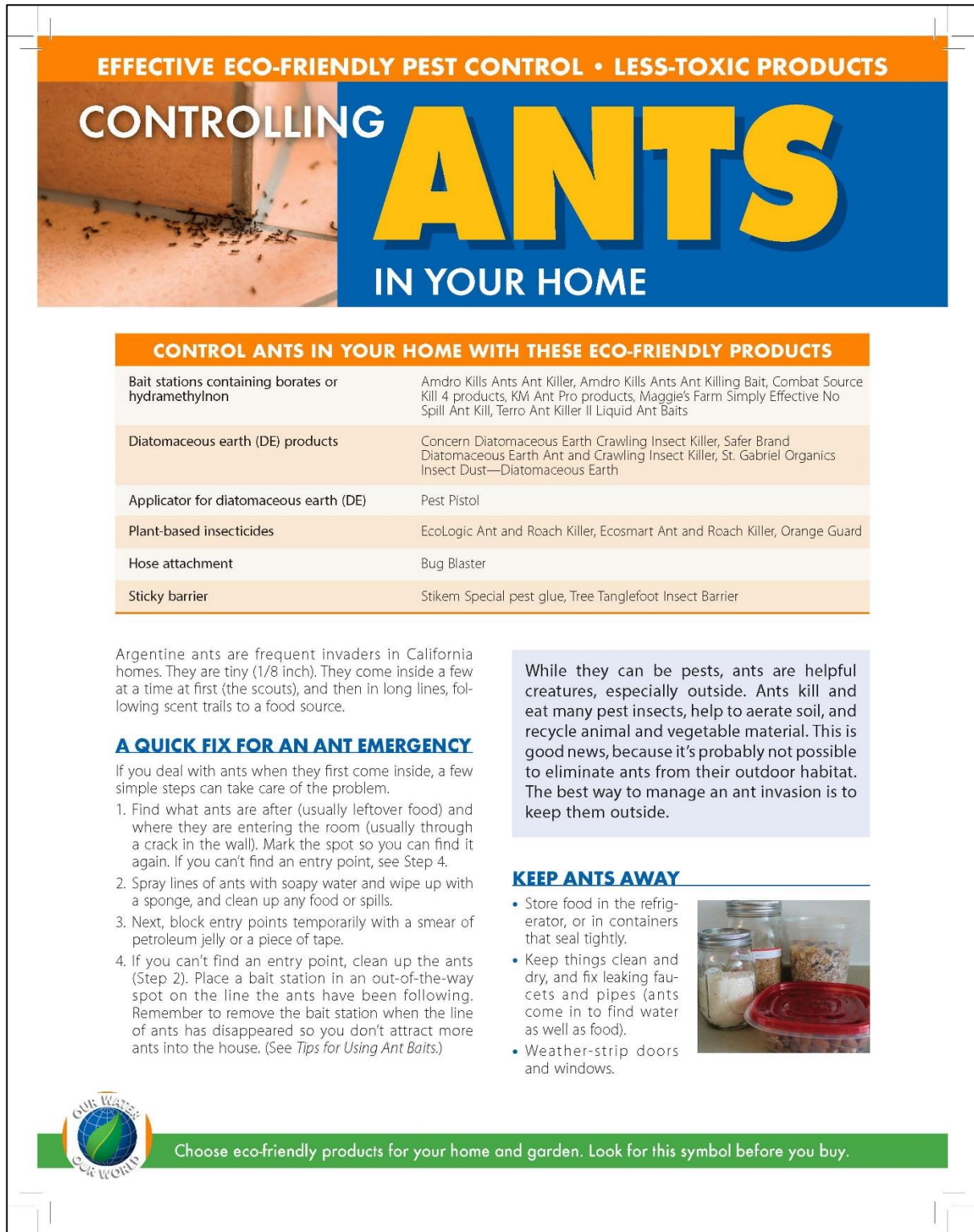
Figure A2. Ant Fact Sheet