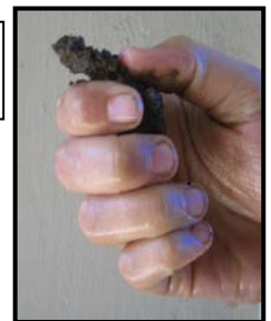
Figure 6. Squeeze soil, pushing