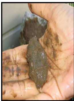
Figure 5. Prepare soil for the ribbon test by moistening and kneading.